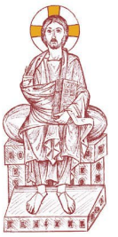
CHRIST, THE HOLY WISDOM OF GOD