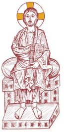
CHRIST, THE HOLY WISDOM OF GOD